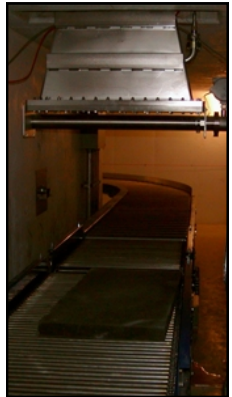
The accelerator scan horn is directed down toward the conveyer with a foam phantom on the rollers.