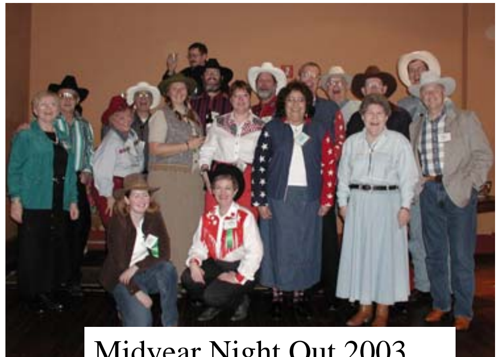
Midyear Night Out 2003