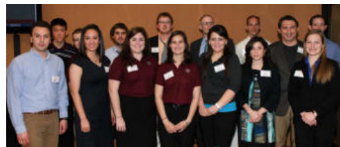
Photos of the Students, Presentations, & Awards at the Annual Student Meeting in Waco