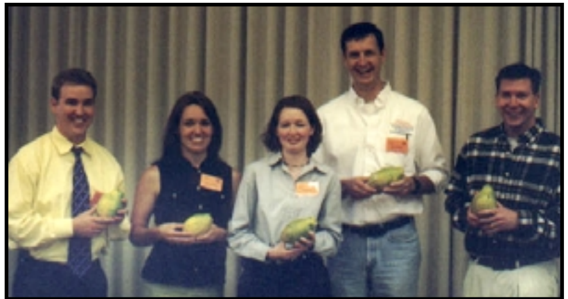
Just a few of those who received the free irradiated papayas at the May 6, 2001, meeting in College Station, TX.