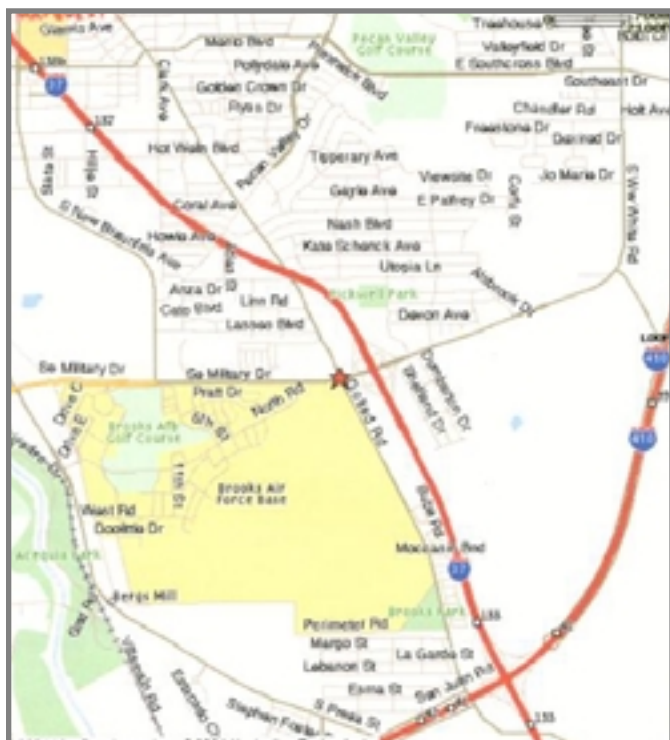
Map to Brooks Air Force Base