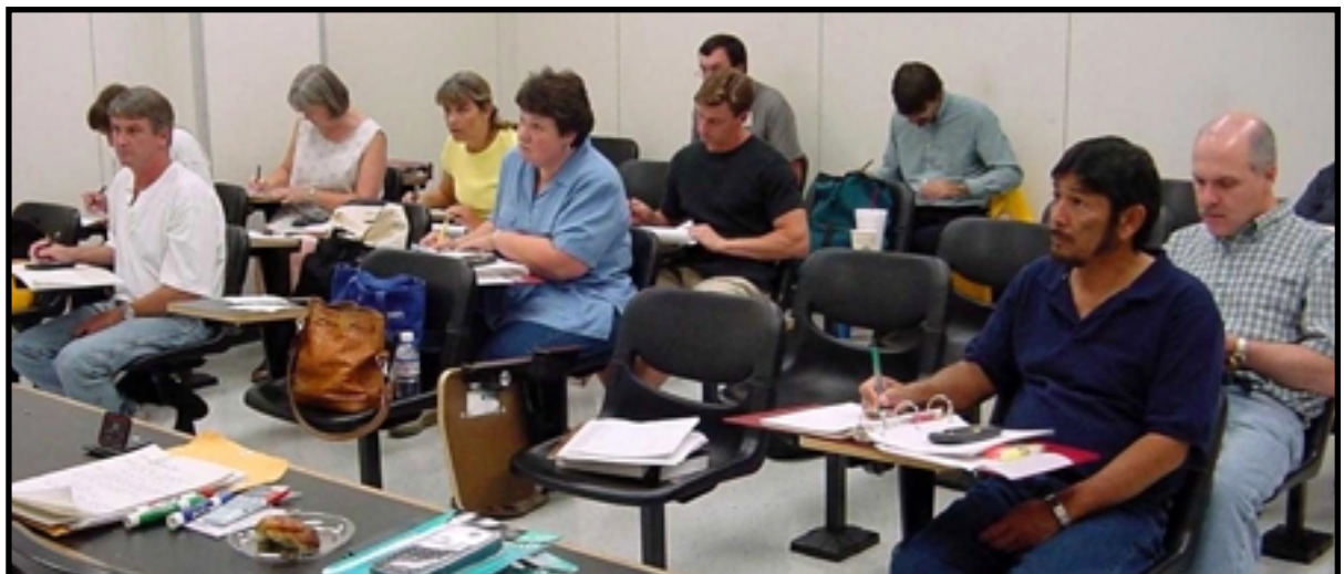
BRC students listening intently during the second week of the 5-week course.

BRC offers its most sincere gratitude to TAMU for providing this critically needed training. The training will benefit all the citizens of our great state as BRC continues its efforts to provide increasingly competent and timely service to all of its customers at a time when many senior staff are approaching retirement. ♦