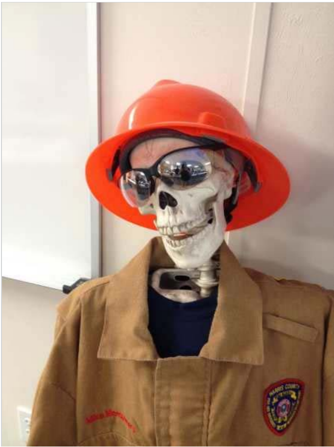
HCFD Emergency Responder