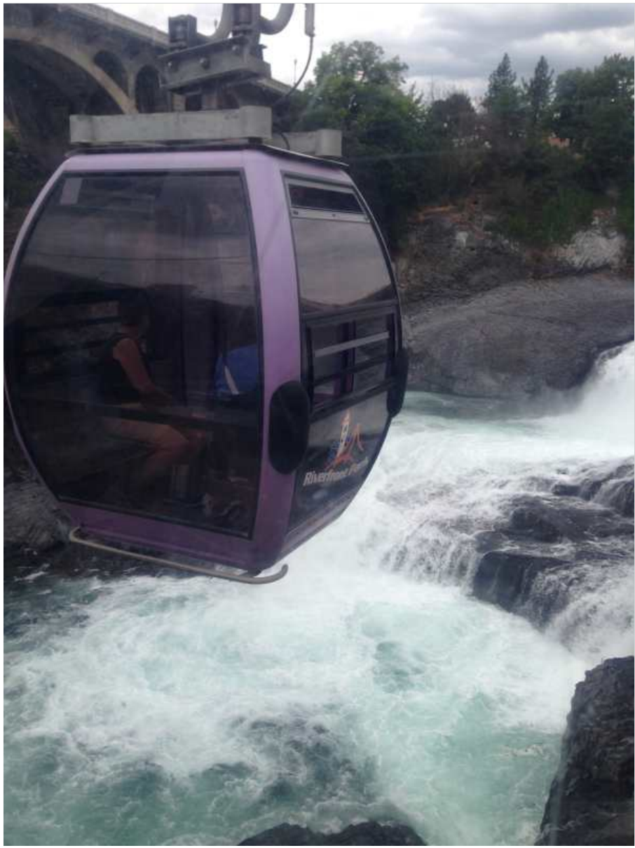
Cable Car and Falls in Spokane