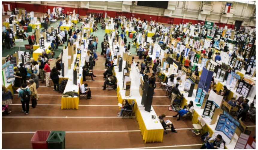
Science & Engineering Fair of Houston hosted by University of Houston.