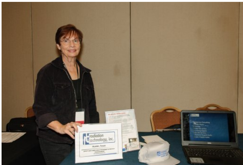
Radiation Technology, Inc.