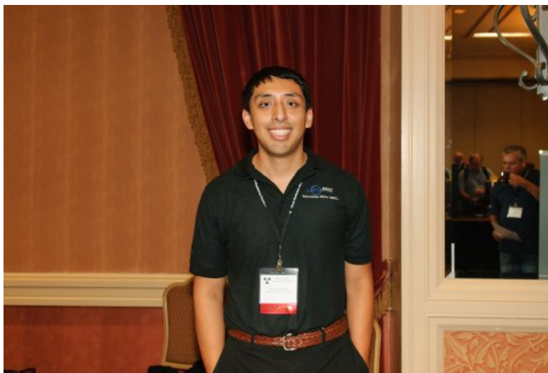
Representative from Berkeley Nucleonics Corporation (BNC)