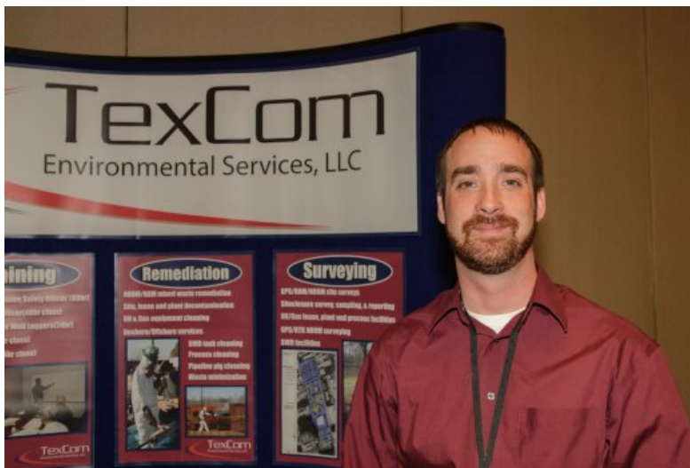
TexCom Environmental Services, LLC