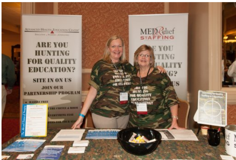
Advanced Health Education Center