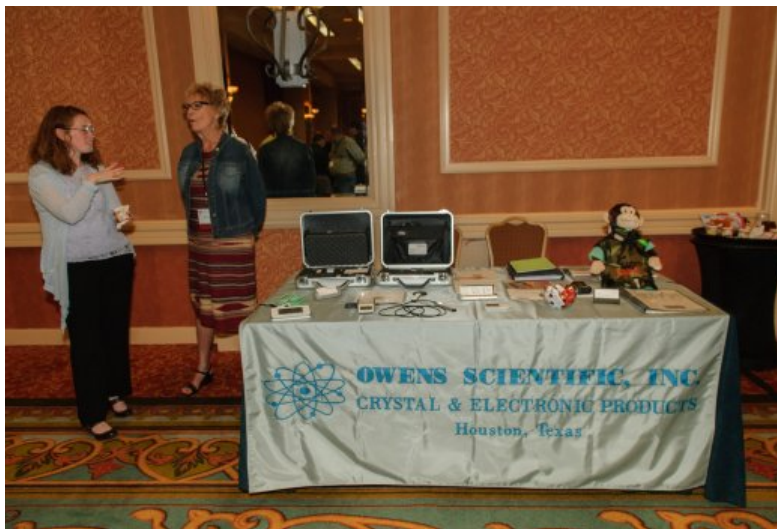
Owens Scientific, Inc.