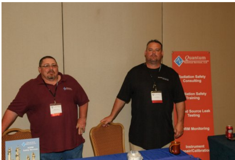
Quantum Technical Services, LLC