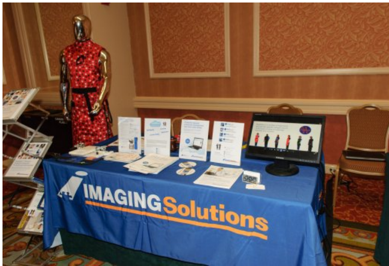
Imaging Solutions of America