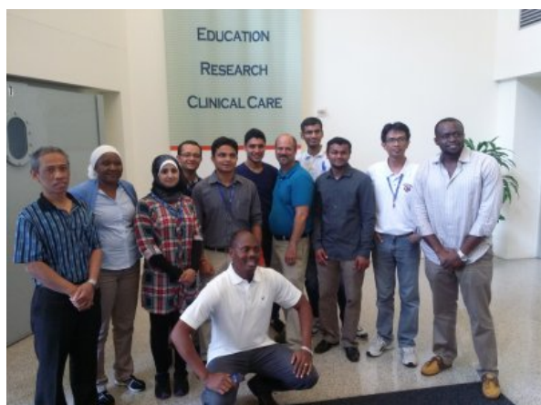
Visiting students stop to pose for a picture at The University of Texas Health Science Center at Houston with the Medical School Building.

The students enjoyed the opportunity to see practical applications of radioactive material and radiation safety professionals at work.