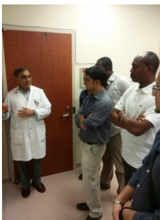
Visiting students listen to diagnostic nuclear cardiology staff on their use and radiation safety with the PET/CT machine.