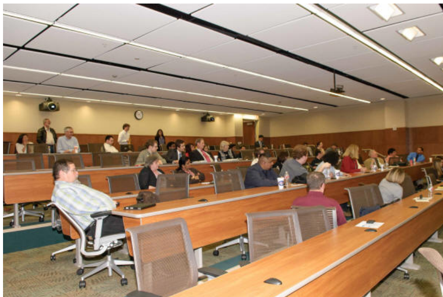
Modern lecture hall at TAMU Health Science Center.